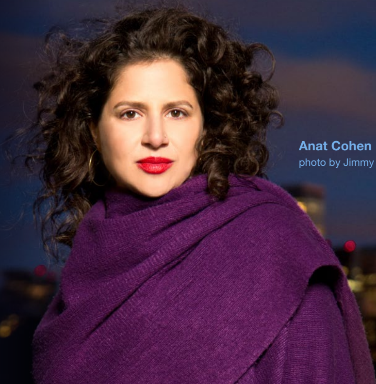
Anat Cohen