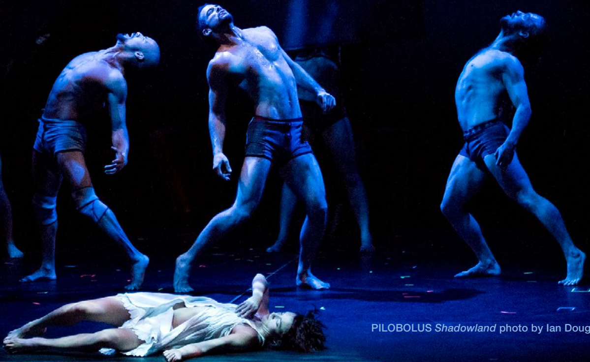
PILOBOLUS Shadowland