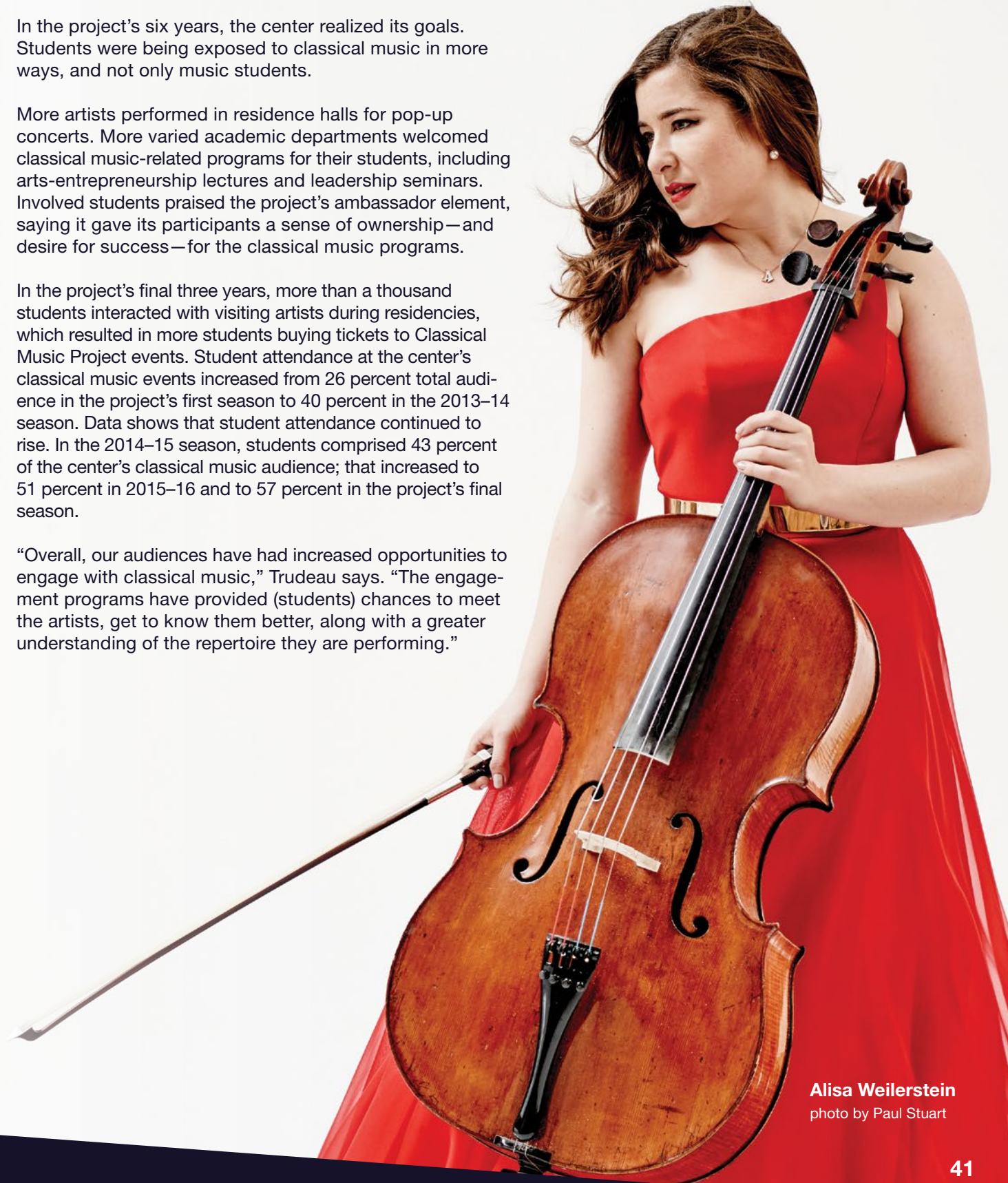
Alisa Weilerstein