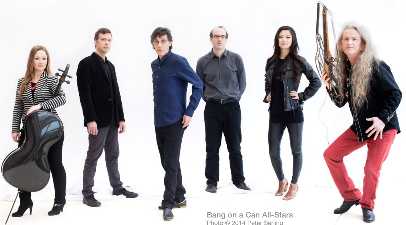
Bang on a Can All-Stars

The contemporary music ensemble Bang on a Can All-Stars spent several days at Penn State with Wolfe and performed the work with the Penn State Concert Choir directed by Christopher Kiver. Preparing for and performing Anthracite Fields was a tremendous challenge for the choir students, and they rose to the occasion receiving accolades from Wolfe and the Bang on a Can musicians.