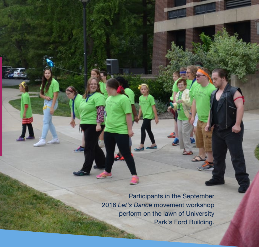
Participants in the September 2016 Let's Dance movement workshop perform on the lawn of University Park's Ford Building.

A N IMPORTANT ASPECT of Center for the Performing Arts engagement activities is participation. Many people learn best by doing, and dance is for every body. And heck, it's fun! Center for the Performing Arts movement workshops for the community embody those principles by partnering with Penn State departments and community organizations to ensure that accessible, engaging, educational, and just plain fun experiences can be had by all.