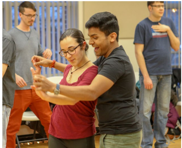
Children, top, show their moves at Cinderella's Ball in 2018. Dancers of all ages, left, learn steps at the 2017 Salsa Social. Participants at the 2018 Friday Night Dance Social, above, get a feel for bachata. Attendees at the 2019 Urban Bush Women Hair Party, opposite, receive guidance from a member of the dance company.