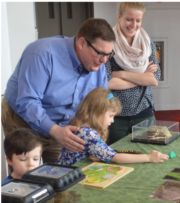
A child, top, works on an activity provided by Matson Museum of Anthropology at the Kids Connections session before the 2019 presentation of Me... Jane. Kids, above, explore items from Shaver's Creek Environmental Center before the 2017 performance of A Year with Frog and Toad.