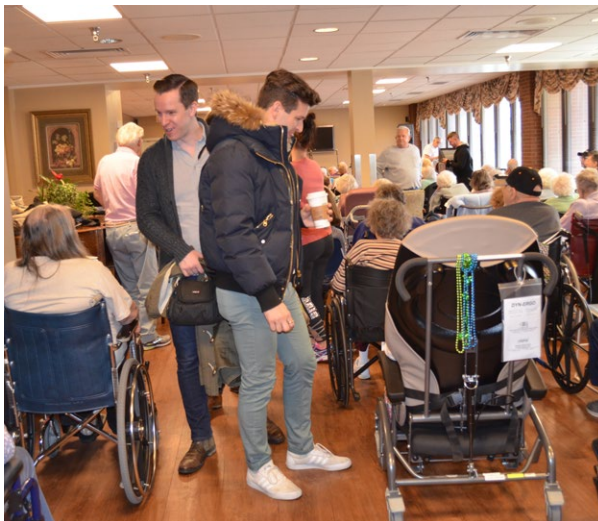
Members of the touring Broadway cast of Jersey Boys perform for and mingle with residents of Centre Crest, a long-term care facility in Bellefonte, in 2018.

The endowment has also allowed the Center for the Performing Arts to offer free tickets to selected presentations, through the Centre County Office of Aging, for distribution to senior center groups.