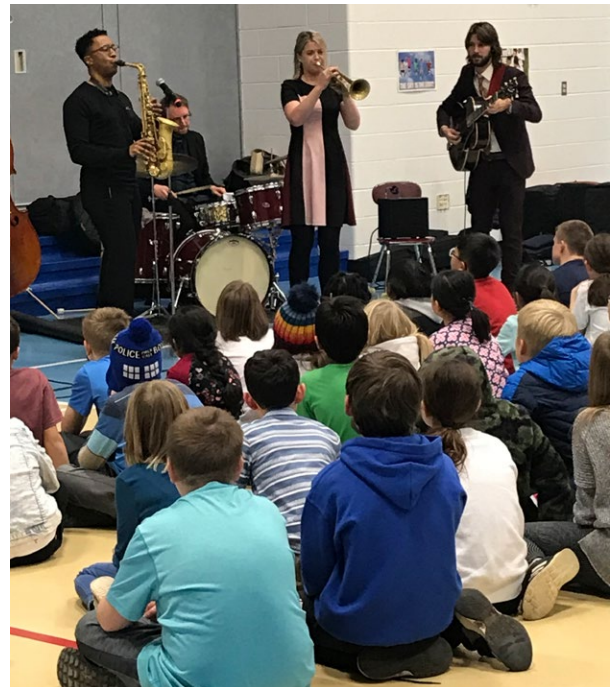
New York City-based jazz musicians perform Let Freedom Swing for students at State College's Easterly Parkway Elementary School in 2020.

After each concert, ensemble members made time for the students to see the instruments up close and to realize they were just like the musicians—with opportunities to play in school bands and orchestras.