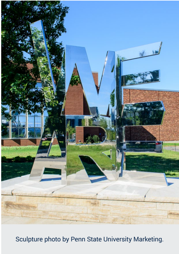
Sculpture.