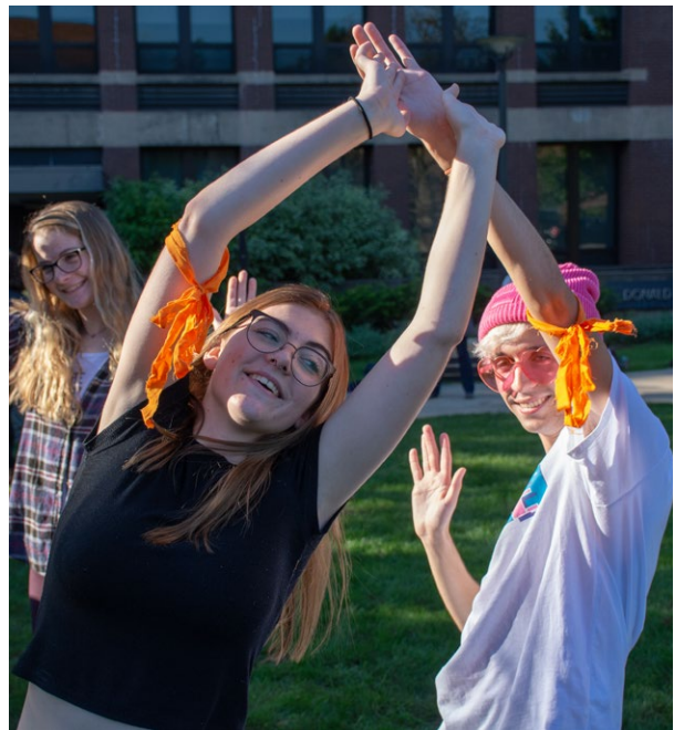
Penn State students and the community come together for a workshop promoting fun, exercise, creativity, and inclusion.

Alliance of Heroic Hearts College of Health and Human Development Department of Communication Sciences and Disorders National Student Speech-Language-Hearing Association (Penn State chapter) School of Theatre